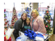
Pictured left are members of our community purchasing the first raffle tickets of the Season.

Pictured right-some of the beautiful trees decorated for Christmas!