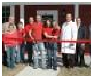
Pictured below-Ribbon cutting ceremony for Pick of the Day Farms.

The Mushroom festival Committee is in need of volunteers. The parade, Lil Mushroom contest, and clean up crew all have spots available. This can be used as community service hours as well. Please call 816-776-6916 for more info.