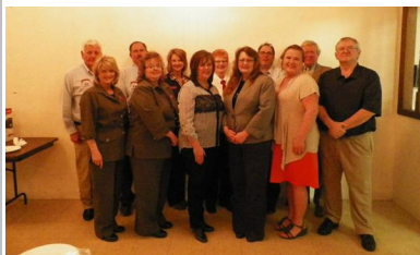
Pictured above Chamber After Hours co-sponsored by The State Bank and The Richmond Shrine Club.