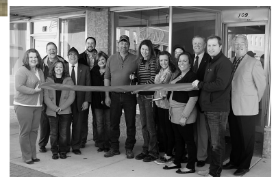
Pictured right-Ribbon cutting ceremony for Pick of the day Farms