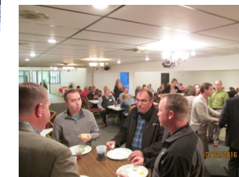
Pictured left– Chamber members networking over Nadler’s appetizers at the Shrine Club

Henkel, The Richmond Shrine Club and Nadler’s Catering Co-hosted a Chamber After Hours on Wednesday, October 12th. There were over 100 people in attendance for the event.