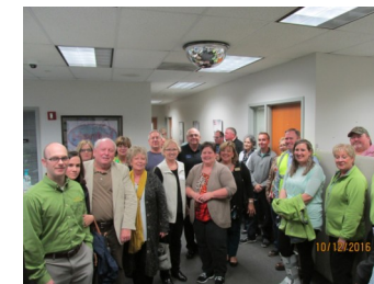
Pictured above– A Group of Chamber members taking a tour of the Henkel facilities

January 2nd, 2016 -Office closed for New Years Holiday