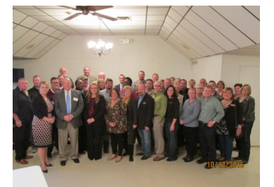
Pictured right- Chamber members gathering at the Shrine Club to celebrate the companies that hosted the event. Thank you to Henkel, The Richmond Shrine Club and Nadler’s Catering!

The Richmond Area Chamber of Commerce will have extended hours from Saturday November 12th to Thursday December 1st for the Christmas Extravaganza