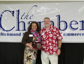
Pictured Right– City of Richmond Parks Board receiving their Beautification Award in recognition of their part in keeping our community beautiful for residents and tourists alike.